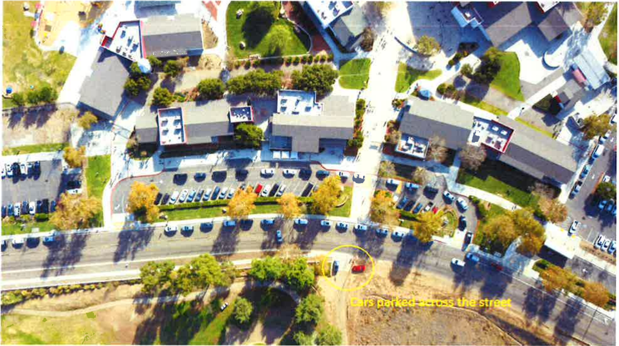
Cars parked across the street