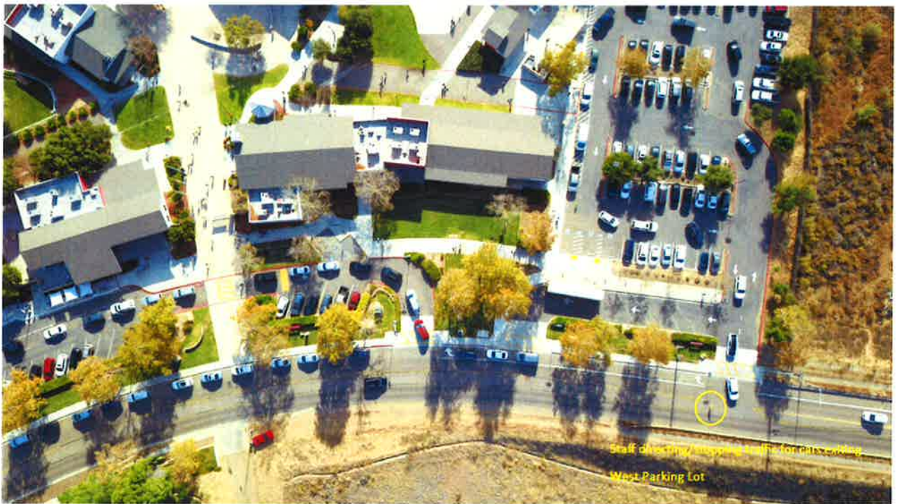
Staff directing/stopping traffic for passengers West Parking Lot